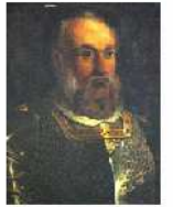
Claude de La Sengle